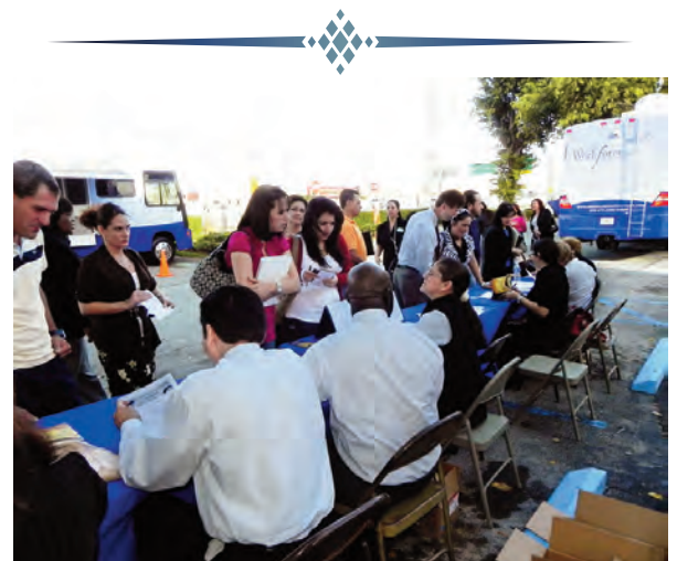
Caption: Mayor's Expo "Empowering The Unemployed" February 25, 2011

Upon the successful completion of the training, the career advisors will assist the participant to a rewarding career path.