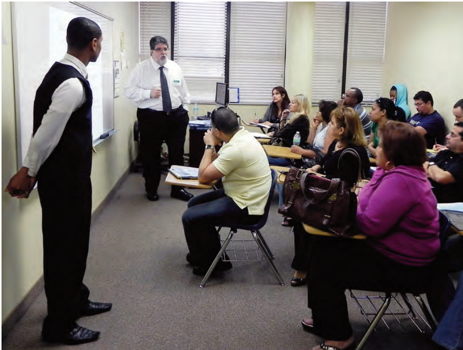
Caption: Mayor's Expo "Empowering The Unemployed" February 25, 2011